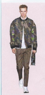
HUNTING WITH VALENTINO.

New Balance $65 Where to buy it? Go to GQ.com/go/fashiondirectories