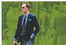
THE VERY RARE DOUBLE-CAMO LOOK.