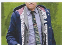
EVER GET BORED WITH YOUR REPP TIE?